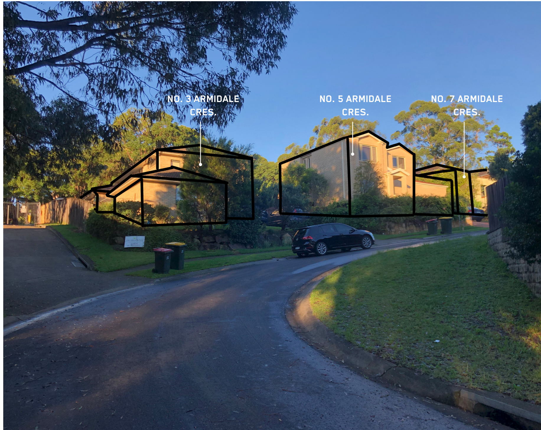
VIEW 1 - EXISITING ARMIDALE CRESCENT SOUTH-EAST