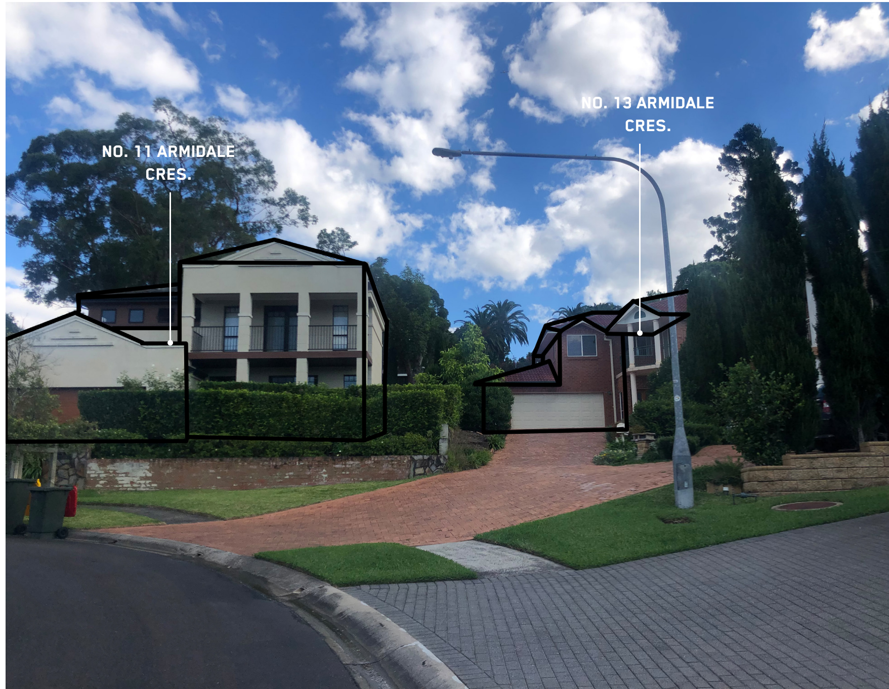
VIEW 2 - EXISITING ARMIDALE CRESCENT NORTH WEST